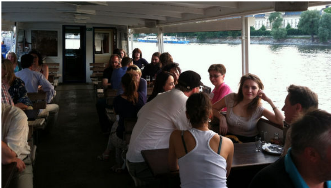
On a boat in Frague