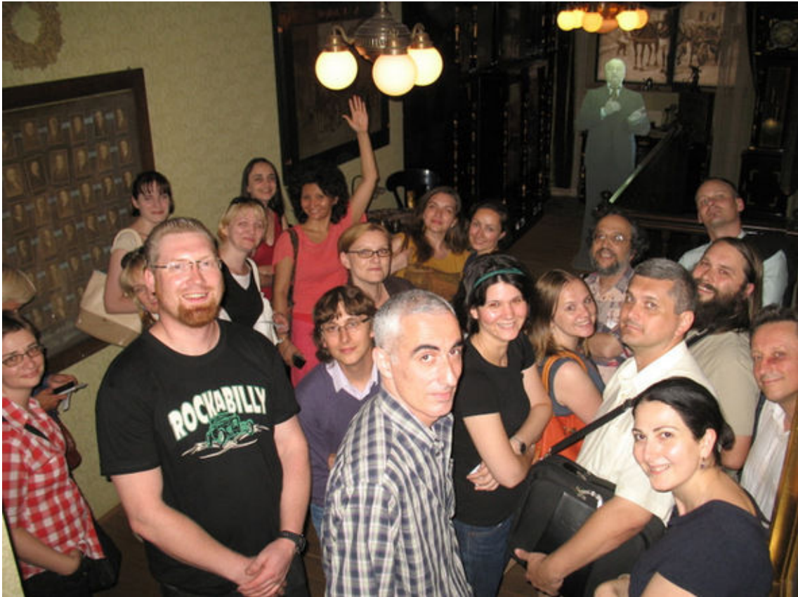
At the brewery

Do you have photos with more/other participants? You're invited to share them.